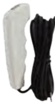
REMOTE SWITCH AVAILABLE