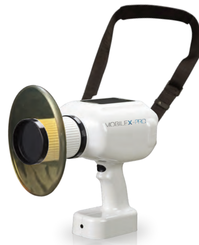
WITH NECK STRAP