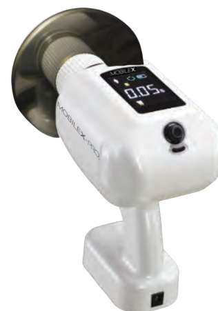
EASY TO OPERATE